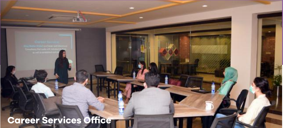
Career Services Office