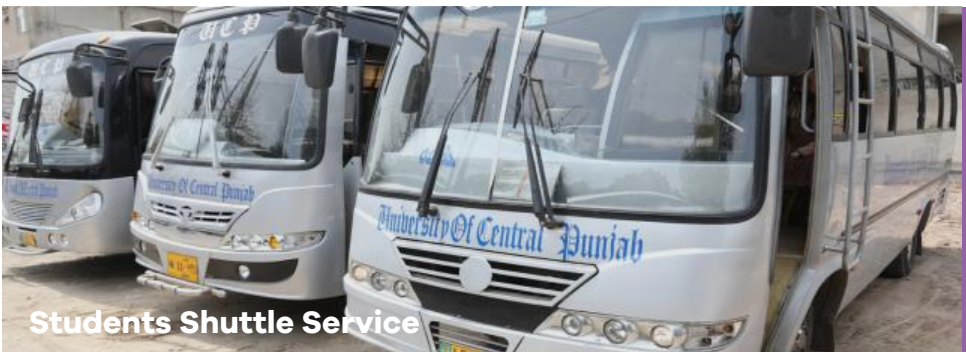
Students Shuttle Service

Safe means of transport at nominal rates