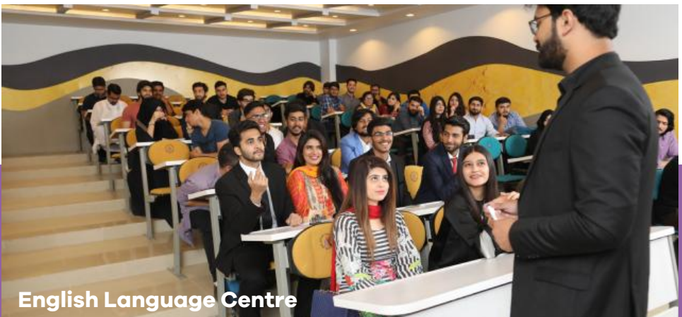
English Language Centre