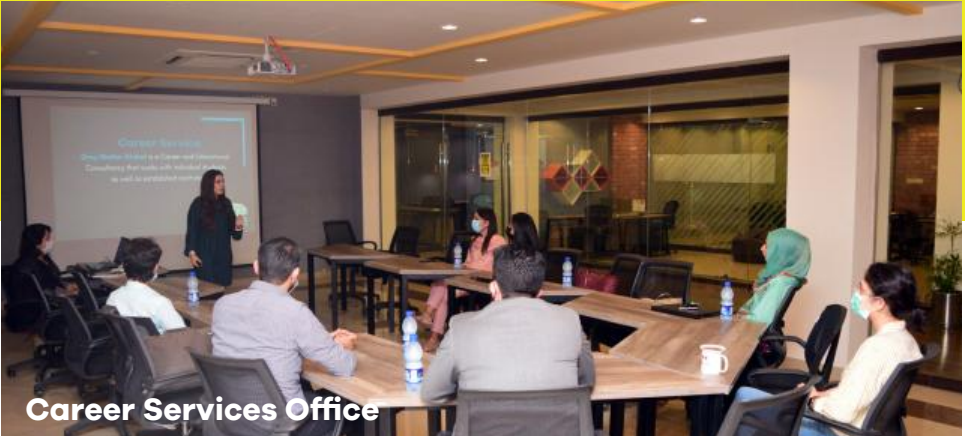
Career Services Office