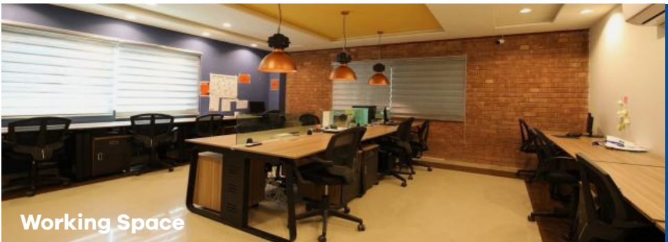
Work space for collaboration and networking