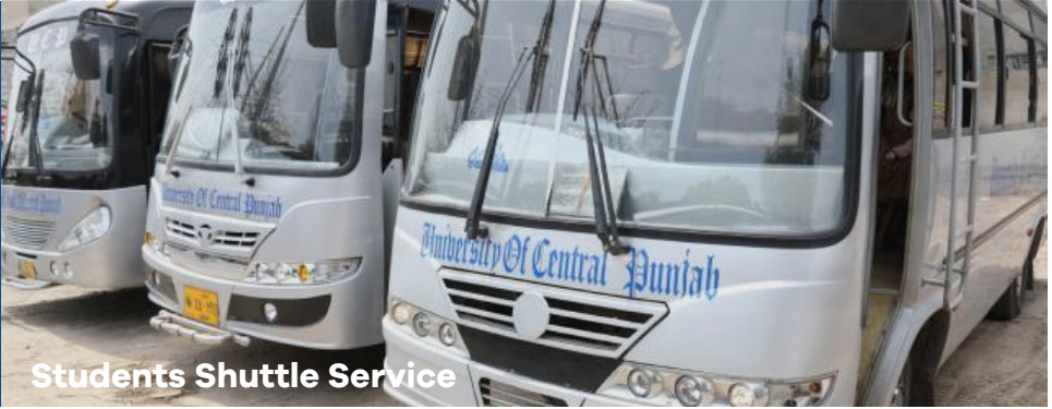
Students Shuttle Service

Safe means of transport at nominal rates