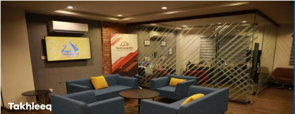
In-house business incubator