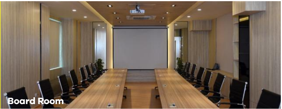
For meetings and brainstorming sessions