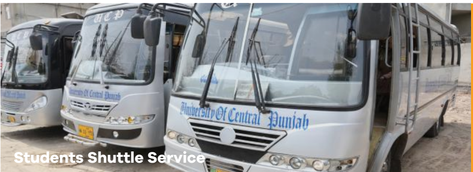
Students Shuttle Service

Safe means of transport at nominal rates