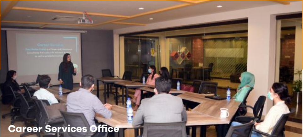
Career Services Office