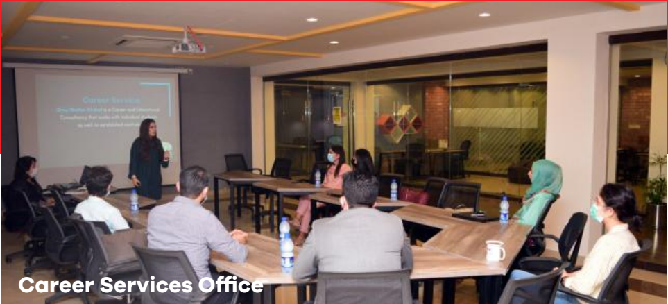
Career Services Office