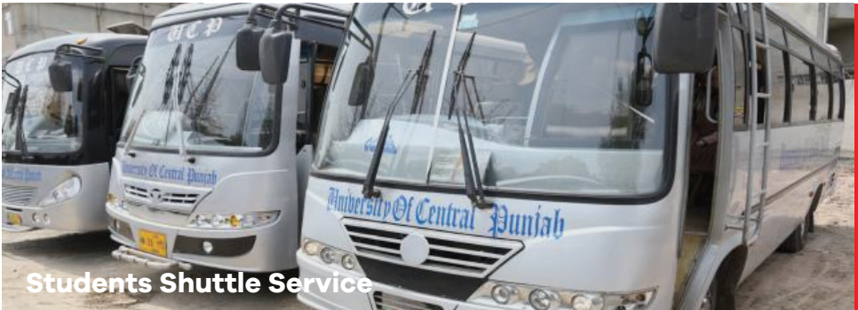
Safe means of transport at nominal rates