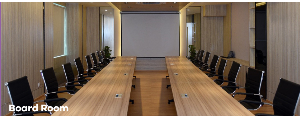
For meetings and brainstorming sessions