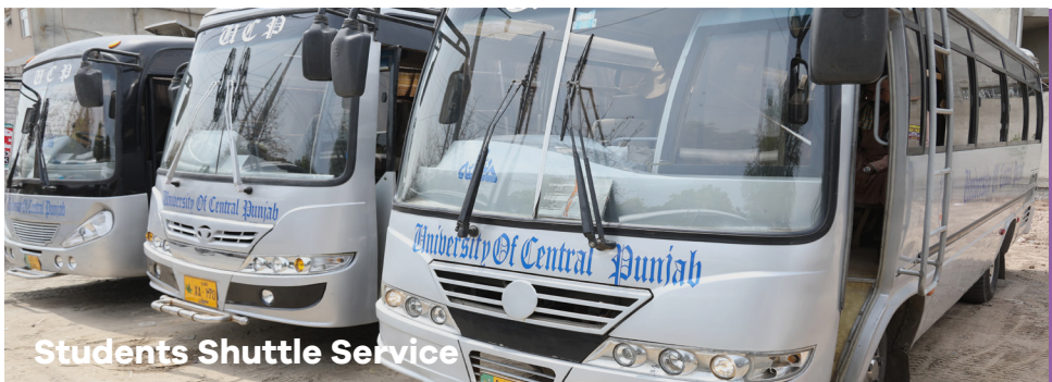
Safe means of transport at nominal rates