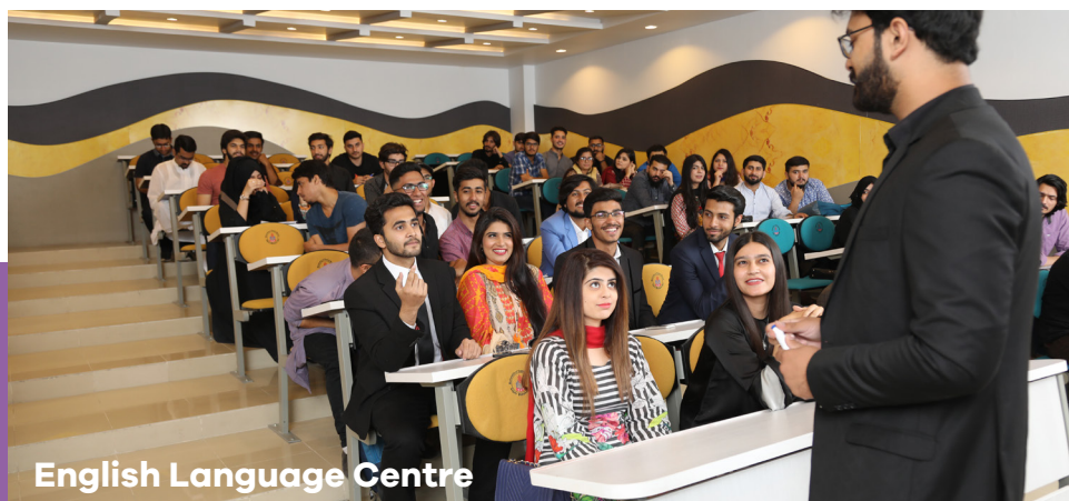
English Language Centre