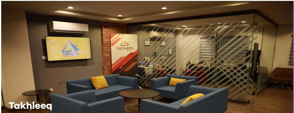
In-house business Incubator