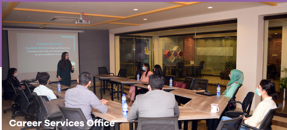
Career Services Office